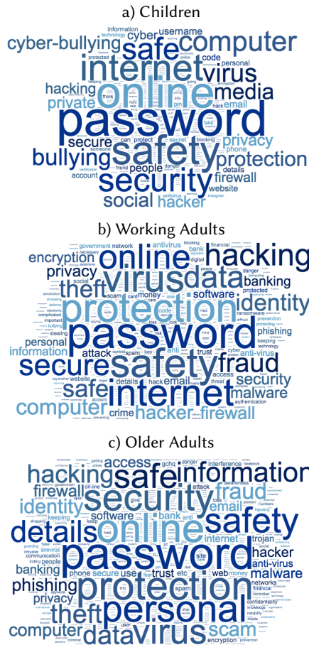
Figure 1: Word clouds for the most frequently listed features of cyber security for each of the three life stages. Larger items indicate more frequent features.

and other personal information on social media sites [2]. Older adults are less likely to adopt PIN or biometric protections for their devices [4], and have been found to be more susceptible to reciprocity-based weapons of influence , whereby adversaries offer rewards for compromising security [8] (e.g. installing malware when lured with a free gift). Older adults have also been found to engage in fewer privacy-related behaviours on social networking sites, but also disclose less information online, and express more concern about other people’s privacy, than younger age groups [5].