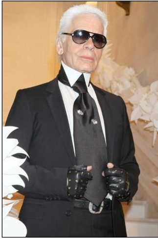
Figures 1, 2 and 3: Dramatic self-presentation by artistic directors Karl Lagerfeld, John Galliano, and Marc Jacobs