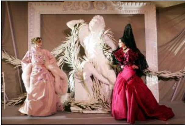
Figure 9: Contamination by physical contiguity, Vuitton Champs Elysées (Paris)