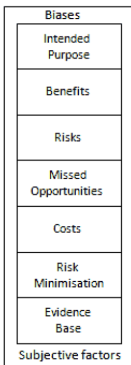
Figure 4: The Risks and Opportunities Framework