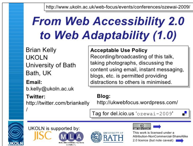
Figure 2: Use of a Twitter ID in a title slide to encourage conversations