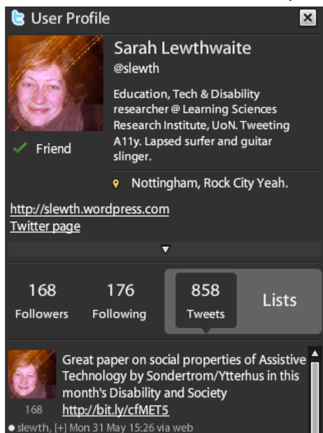
Figure 1: A Twitter biography can make an impression

Sarah's Twitter ID is @slewth. When I looked at Sarah's Twitter biographical details (see Figure 1) I saw she had similar interests in Web accessibility.