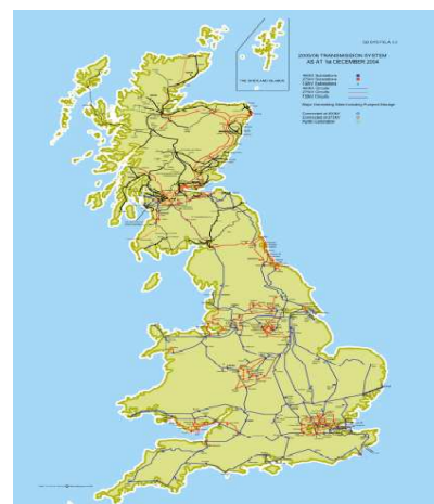
Fig. 2. Geographical map of the UK network.

The LRIC charging model is demonstrated on a large-scale system taken from WPD network, which consists of more than 2000 nodes. Fig. 2 is the geographical map of the UK network and the chosen system is located in its southeast.