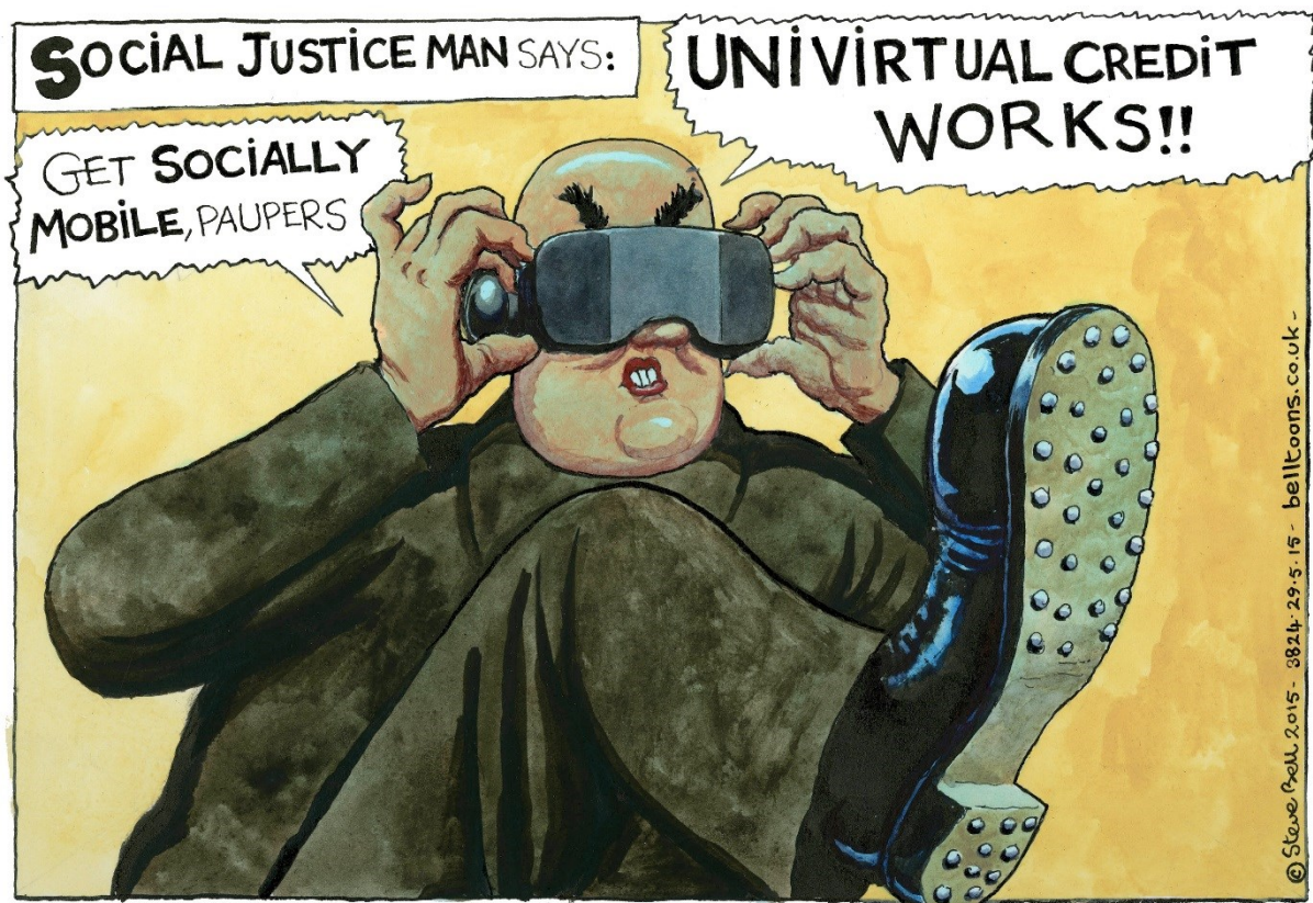
From The Guardian, 29.5.2015

Universal Credit and takes as its starting point the full protection of lower paid workers with children'. We agree with the need for a thorough review, but would argue that the issues are broader than the protection of lower-paid workers with children. Fundamental questions remain outstanding - about the multiple functions of social security for working-age people (both in and out of work), about the basis of qualification for benefits (in particular whether this should involve a means test or not), and about the unit of assessment (whether this should be an individual or a family). Key issues about the purpose and nature of social security provision in the twenty-first century in the UK are still to be resolved.