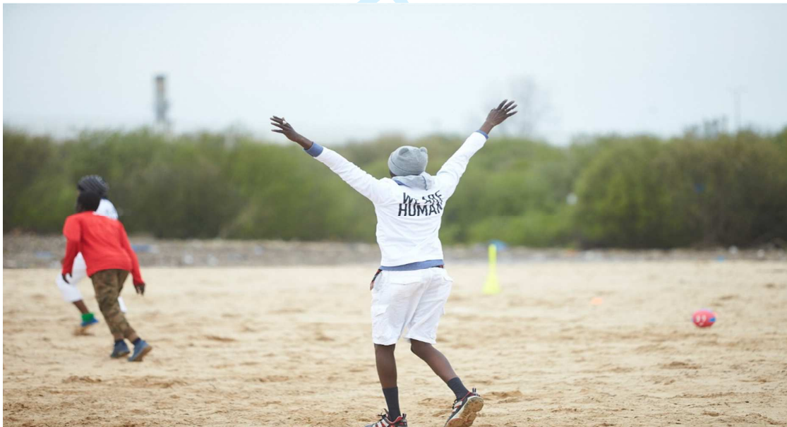
Figure 2. A moment of celebration during Play4Calais's Football Friday tournament.

After all, within the immobilizing and exclusionary spatialities of the camp, any act of playing – long theorized as an affective, metaphysical force opening up humanizing flows of ideas, memories and pre-cognitive capacities (Huizinga, 1955; Shields, 2015) – serves to contest, even subvert, imposed regimes of bare life, brutality and suffering. More than a passive form of ludic expression, then, the very claim to access opportunities to play, let alone the conferment of a 'right' to play, engenders a politics of dissensus in Ranciere's terms – that is, it unsettles or disrupts the formal consensus which renders the claims of refugees 'uncounted'. As a case in point, consider the inaugural Play4Calais-led 'Camp Championship', hosted at the opening of the newly-constructed sports field. By virtue of bringing together young refugees – united in mutual enjoyment, laughter and intense competition, and by the words, 'WE ARE HUMAN' – these events can, at the very least, be said to disrupt prevailing constructs of refugees as 'mere' victims (See figure 2.), thereby instigating a degree of political struggle over the spatial geographies of camp life.