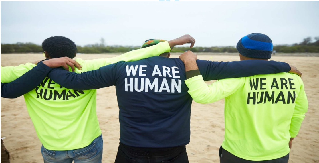
Figure 1. Refugees united ahead of a football tournament in the Calais Jungle.