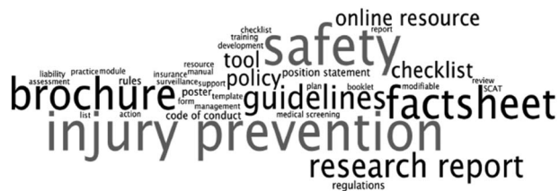
Figure 2 Word Cloud of most common types of sport safety resources available from the NoGAPS organisations. NoGAPS: National Guidance for Australian Football Partnerships and Safety project.

resources, such as fact sheets and flyers, than they did formal policies or regulations. Resources aimed at knowledge translation through education and guidance, such as research reports and guidelines, were the second and third most common types of documents disseminated by these organisations. Figure 2 clearly depicts the numerous types of resources (such as fact sheets), with the frequency of their appearance in the catalogue indicated by font size.