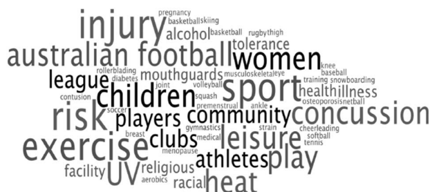
Figure 3 Word Cloud of most common sport safety issues, target groups and sports found in the sport safety resources available from the NoGAPS organisations. NoGAPS: National Guidance for Australian Football Partnerships and Safety project.

The range of sport safety issues addressed by items within the catalogue is shown in table 2 and figure 3. Table 2 shows that resources for the prevention of physical injuries were the most frequent, which may be due to the focus of the sports injury prevention field being predominantly on biomechanical and musculoskeletal interventions. Resources for sport-specific injury prevention guidelines were the second most frequent issue addressed by the documents in this catalogue. This covered very popular sports such as running and cricket, but also included resources for less popular sports such as aerobics and in-line skating (rollerblading). Third, risk management and safety procedures, such as match day checklists, were well covered by all six organisations. In addition to injury prevention resources, four organisations also disseminated broader health promotion resources such as physical activity promotion for diabetes prevention. Figure 3 depicts the most common topic issues (such as concussion)—with frequency indicated by font size—as well as the target groups (such as women or children) and the sports they addressed (such as Australian football).