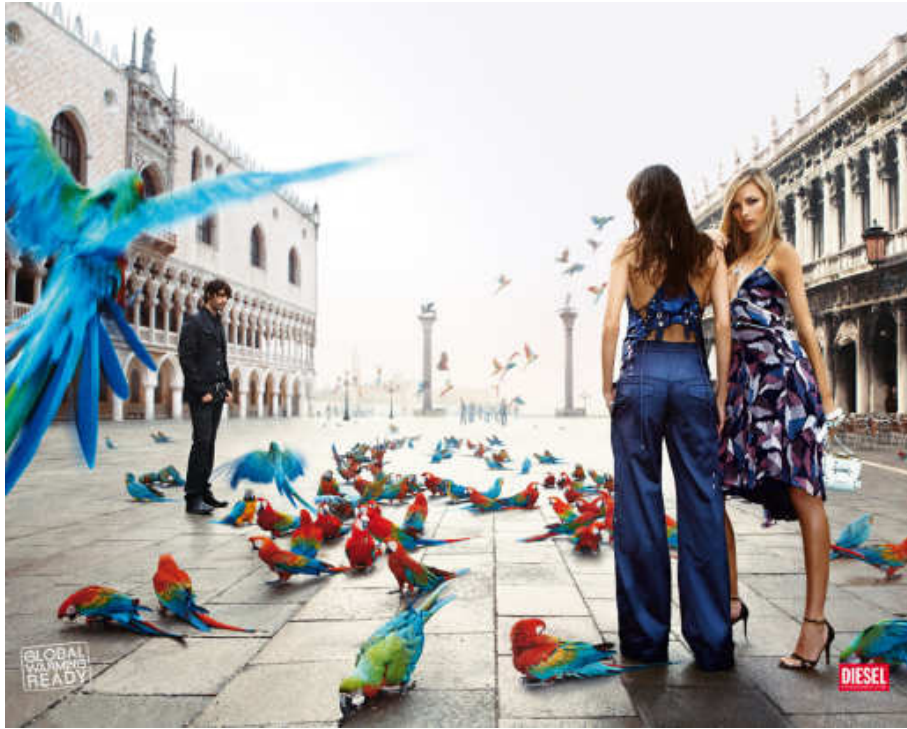
Tropical birds in St Mark's Square, Venice