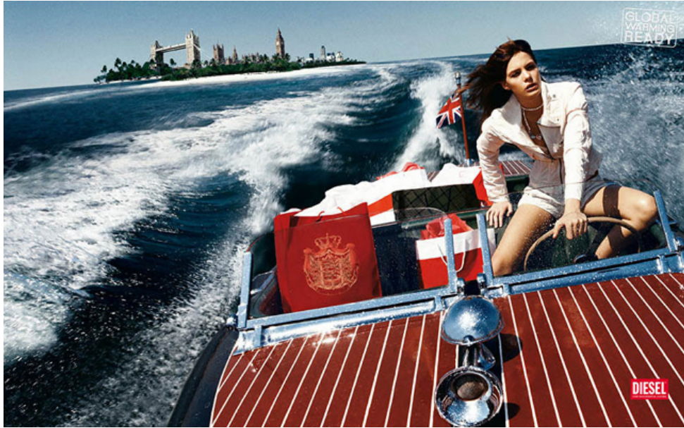
London is an island; the UK is submerged in water