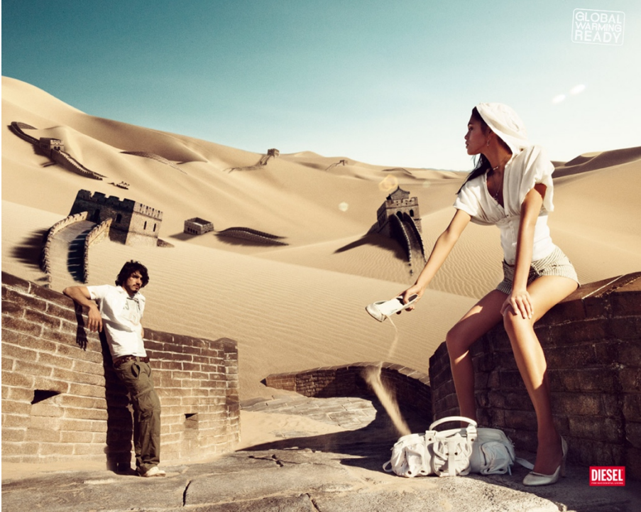
Sandy desert overtakes the Great Wall of China