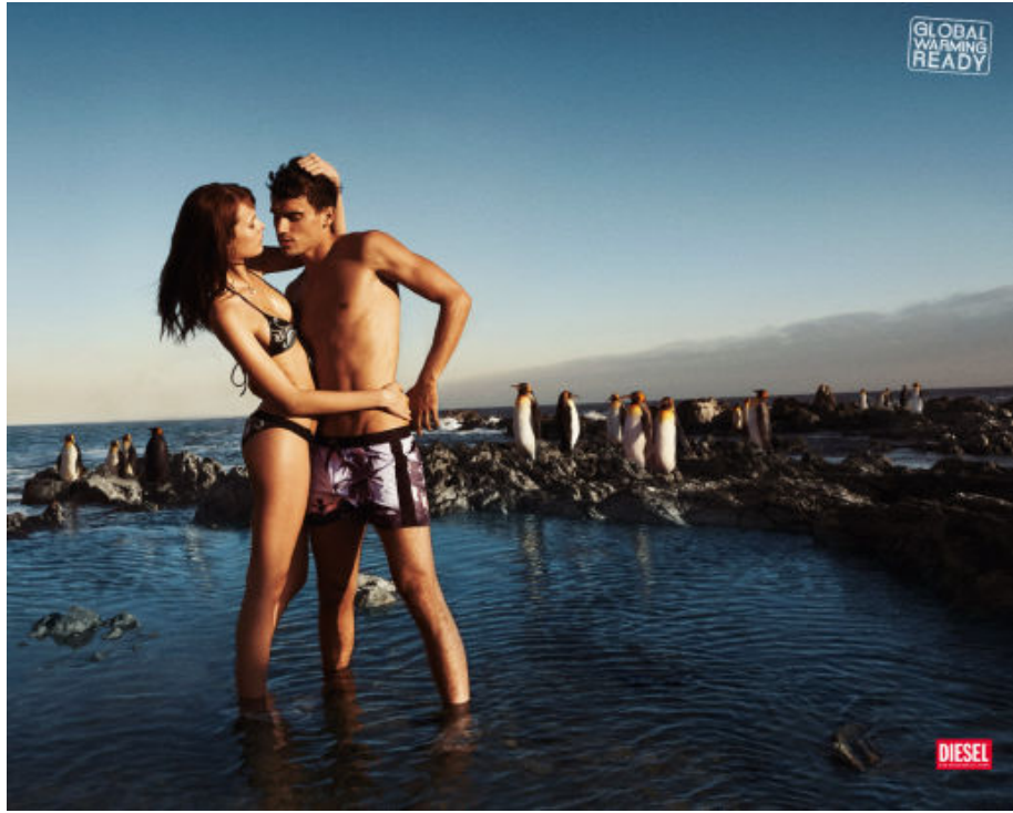
Summer holidays with the penguins in Antarctica