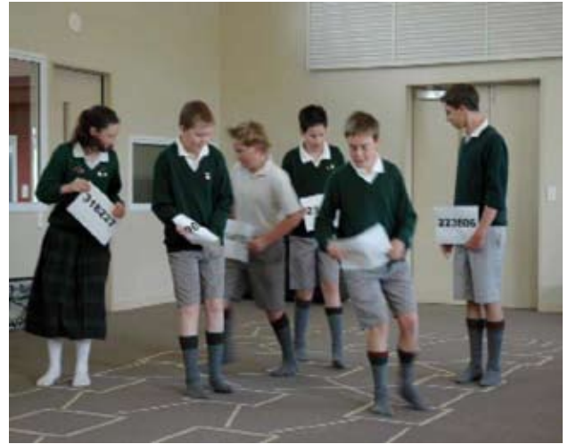
Figure 3: From a video demonstrating a parallel sorting network

The videos are freely available on the internet, primarily through YouTube. However, some schools block access to YouTube, and so the videos have also been distributed by the more accessible site, TeacherTube.com.