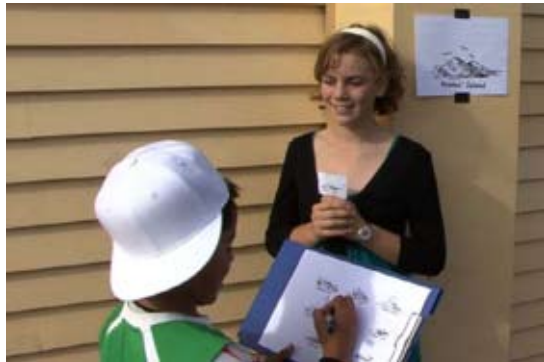
Figure 2: Visiting a node in a finite state machine (aka drawing a pirates’ map)

great ideas of Computer Science without using computers . Later we will discuss how this can be achieved, but we note that this does not involve simply having children simulate the running of a computer, which in itself can be a very tedious activity. Generally the unplugged activities involve problem solving to achieve a goal, and in the process dealing with fundamental concepts from Computer Science. For example, one activity involves trying to work out an incomplete “pirates’ map” that is actually a finite state automaton; the activity involves running around the playground, trying to find a path to “Treasure Island” (Figure 2).