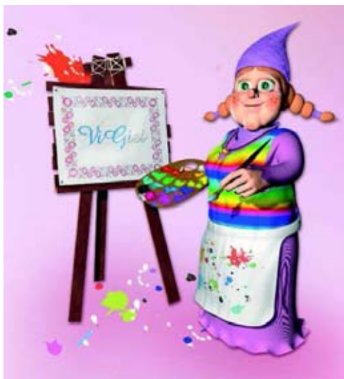
Figure 5: The character “Vi Giei” (VGA) from the Realm of Si Pihuh

A related project that is very much focussed on the storytelling approach to exposing young students to CS is the story of Si Pihuh (Bianco and Tinazzi 2004), based on fictitious characters (Figure 5) who live in a computer (the “realm of Si Pihuh” – pronounced CPU). We are looking into the possibility of incorporating these characters with a visually based programming language such as Alice, and then having children experiment with kinaesthetic activities from Unplugged in this environment, combining the motivation of story, the activities of Unplugged, and the experience of computer programming.