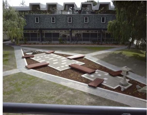
Figure 4: A maths and computer science garden

the logic of the problem, which is not dissimilar to a conventional programming exercise for a CS class. Currently we are not aware of any trials of this approach, although there are camps that have been run that have the students doing Unplugged activities in one part of the day, and (unrelated) programming activities at a different time.