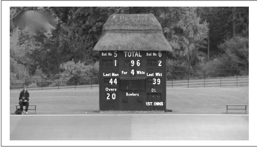
Figure 5. Acknowledging the boundary between self and other.

saliency of a situation and the ethical responsibility of the researcher (Jones et al. 2020, 159).