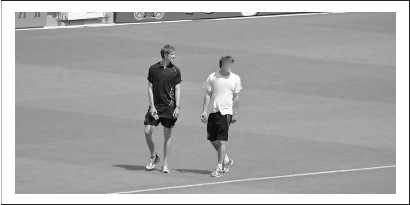
Figure 3. Creating space for one-to-one interaction.

privacy that this ritual afforded both observer and observed that enabled other performances to be engendered in conversation away from the performative pressure and scrutiny of the wider group. According to Turner (1987, 81), (role) performance is a reflexive action through which we come to know ourselves and each other better, crystallizing a process of knowing that is central to the ethnographic endeavor. As an ethnographic encounter, these moments helped to reveal that although “you” (cricketer) and “I” (researcher) are different, we share substance as emerging adults with similar outlooks, ideals, and concerns.