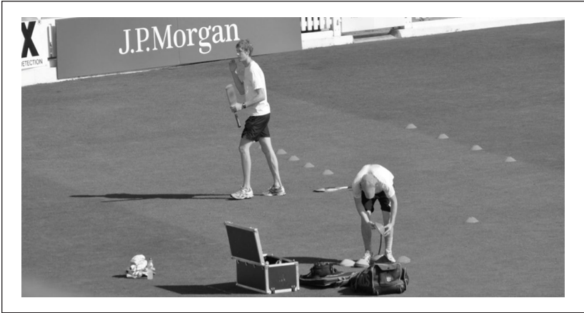
Figure 2. Taking an active part.

pre-match preparations as displayed in Figure 2. This, however, was not without controversy when I sacrificed the principle of voluntary subservience, I used to negotiate access and build rapport with Coach. During one of my early match-day experiences, I began to respond to players' requests for "throw downs" 6 to help them warm up. My hands-on involvement brought with it a sudden increase in status which Coach was quick to acknowledge and confront. Later that day, I witnessed Coach chastise his team for their "lazy, student mentalities" in the changing room for seeking my support. Though directed at his players, I knew that, in effect, his words were aimed at me as a warning against venturing too close to his prized assets. The incident concerned me not least because my actions had inadvertently got the players into trouble, but it also threatened to destabilize the rapport I had begun to establish with Coach and risked imposing further distance between me and his players.