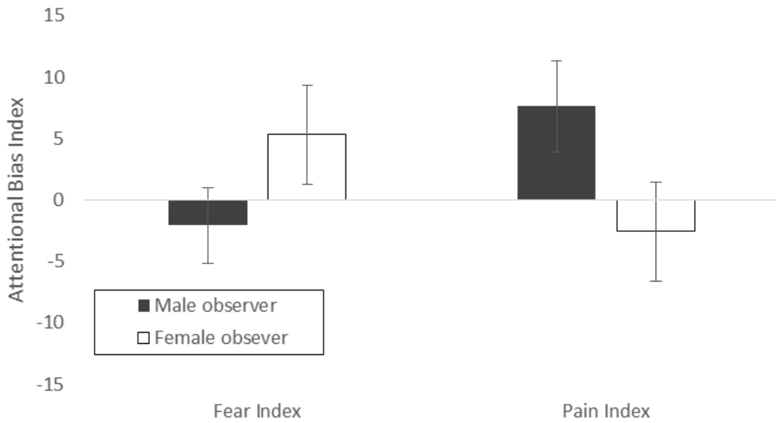
Figure 2. Observer gender differences in attentional bias toward fear and pain expressions in Experiment 3

Note. A positive score is taken to indicate a biases towards the location of target expressions, whereas a negative score is indicative of an attentional bias away from such expressions