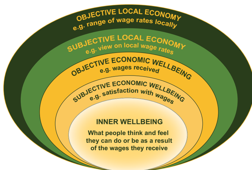
An example of the layers approach for the economic domain

What do the respondents think or feel they are able to do or be?