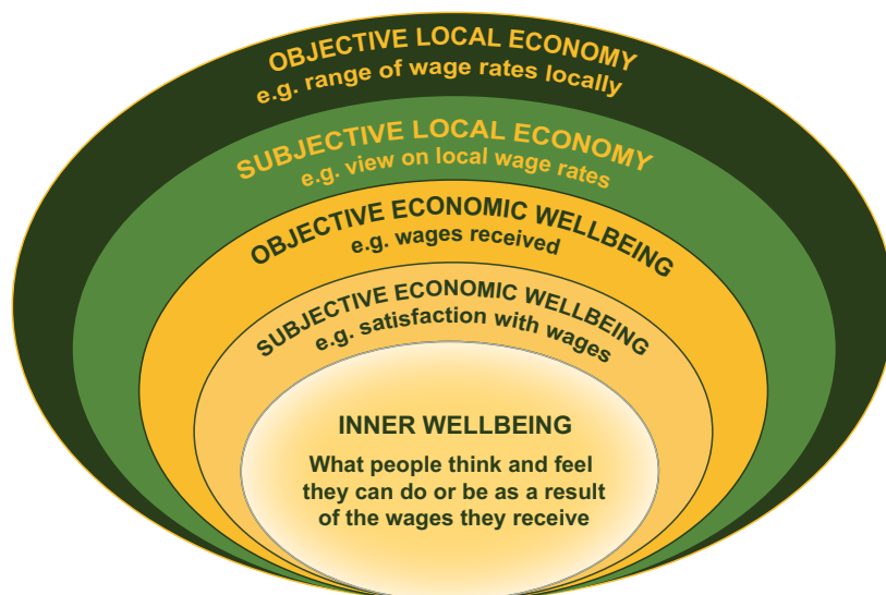
An example of the layers approach for the economic domain

What do the respondents think or feel they are able to do or be?