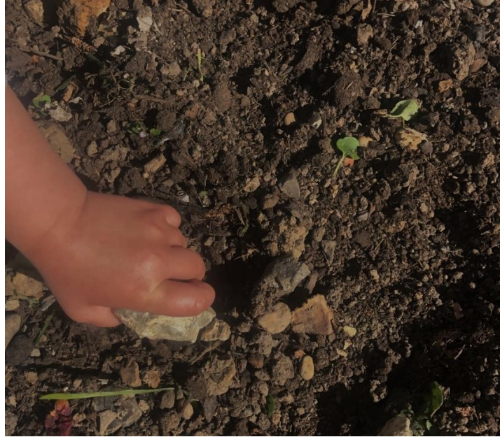
Figure 2. A Stone