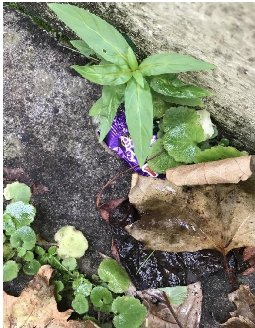
Figure 4. A Plastic Chocolate Wrapper

A walk on the beach. Brightly coloured chocolate wrappers swirl gold and blue in the wind, faded by the sun and sea. Wrinkled wrappers transiently peak through the pebbles, ever reconfiguring, turning, and returning with the tide. The wrapper offers a faint configuration of its past intended as an attractive protective coat to a deliciously sweet cocoa, milk, and sugar concoction. A walk on the beach will never be the same.