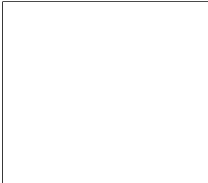
Figure 3. A Lost Lanyard

My object is a batik lanyard. I first encountered it during a research visit to a primary school for unschooled children in Jakarta, Indonesia in 2015. The school, Sekolah Aman (a pseudonym) evolved in a partnership between students and staff in a nearby international school, local community members, and a business. These partners wanted to effect change together, by building a school which provided safety, nourishment, health, and education to marginalized children, and brought wildlife back to a despoiled urban environment.