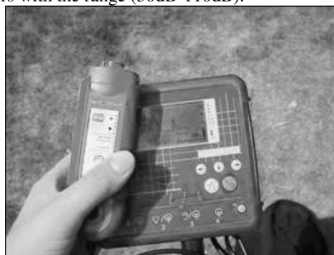
Figure 1 Logbook GL with additional Sound Sensor.

The study used Logbook GL data loggers (see Figure 1) provided by ScienceScope with additional plug in Sound Sensors with the range (30dB-110dB).