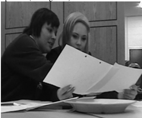
Figure 3. 'Manual' group students considering their graphs.

These students were given two tables of data; one included the data collected by them/their partner and a second table of data collected by the researcher. The students were given all the data points for each of the twelve-second recordings but they were told they could choose which data to display in each graph and were given ideas such as choosing every other point, randomly picking 10 points or choosing a section of time. The original data table included 96 data points spanning 12 seconds of data. By providing the students with the whole data set it allowed the students to see all the available data while giving them control to graph what they felt was important (See figure 3).