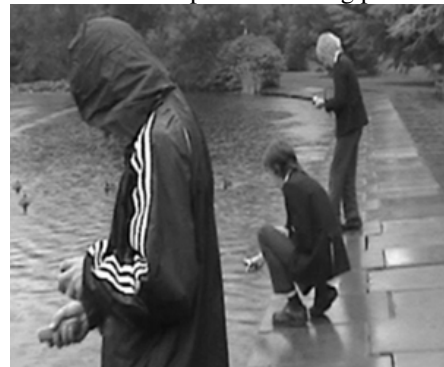
Figure 2. ‘Self’ group students collecting data by the pond

These students were given individual data loggers and were shown how to use them. Each student then visited one of three possible counterbalanced locations and spent 15 minutes taking a number of twelve-second recordings and choosing which recording they would like to analyse. At the construction site location the students stood on one side of a high safety wall with construction workers on the other side. They took recordings of the sounds made at the site. The students who visited the pond took recordings of the ducks and the fish in the water (see Figure 2). Finally the students who went to the field went to an area which is often quiet so they recorded sounds of birds, and the occasional person walking past.